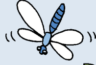
Illustration: Corinne Welch © Copyright Royal Society of Wildlife Trusts 2015

Remove out of control plants or cut them back with scissors.